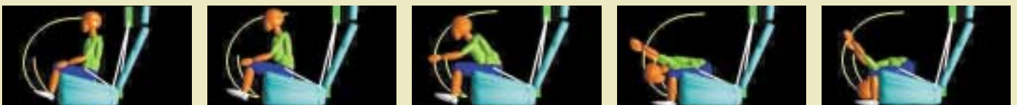
6 year-old child dummy, scooted forward in seat, restrained by the lap belt only. 35 mph crash. Extensive dummy movement.